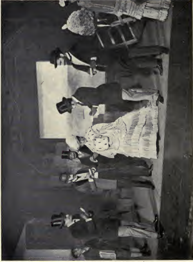
AURELIA. I'll tell you a secret: I want the big crowd to love me! I want to win the hearts of the gallery boys!